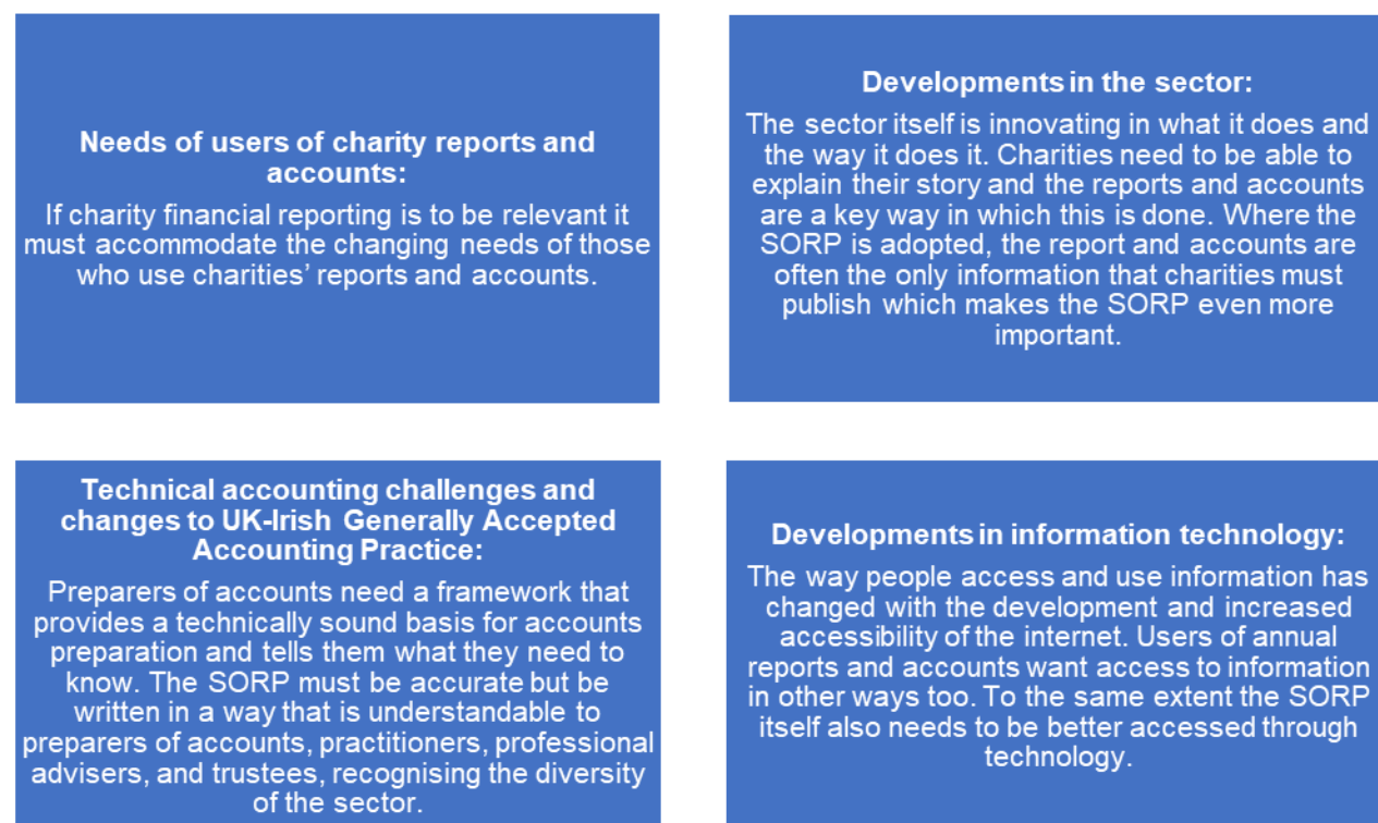
Figure 1: Focal points for SORP development

To be effective the SORP has to be kept up to date, not just in terms of accounting standards but also the expectations and needs of stakeholders and users. Keeping it up to date is where we now need help from our engagement partners. There are four areas where we need to keep abreast of changes: